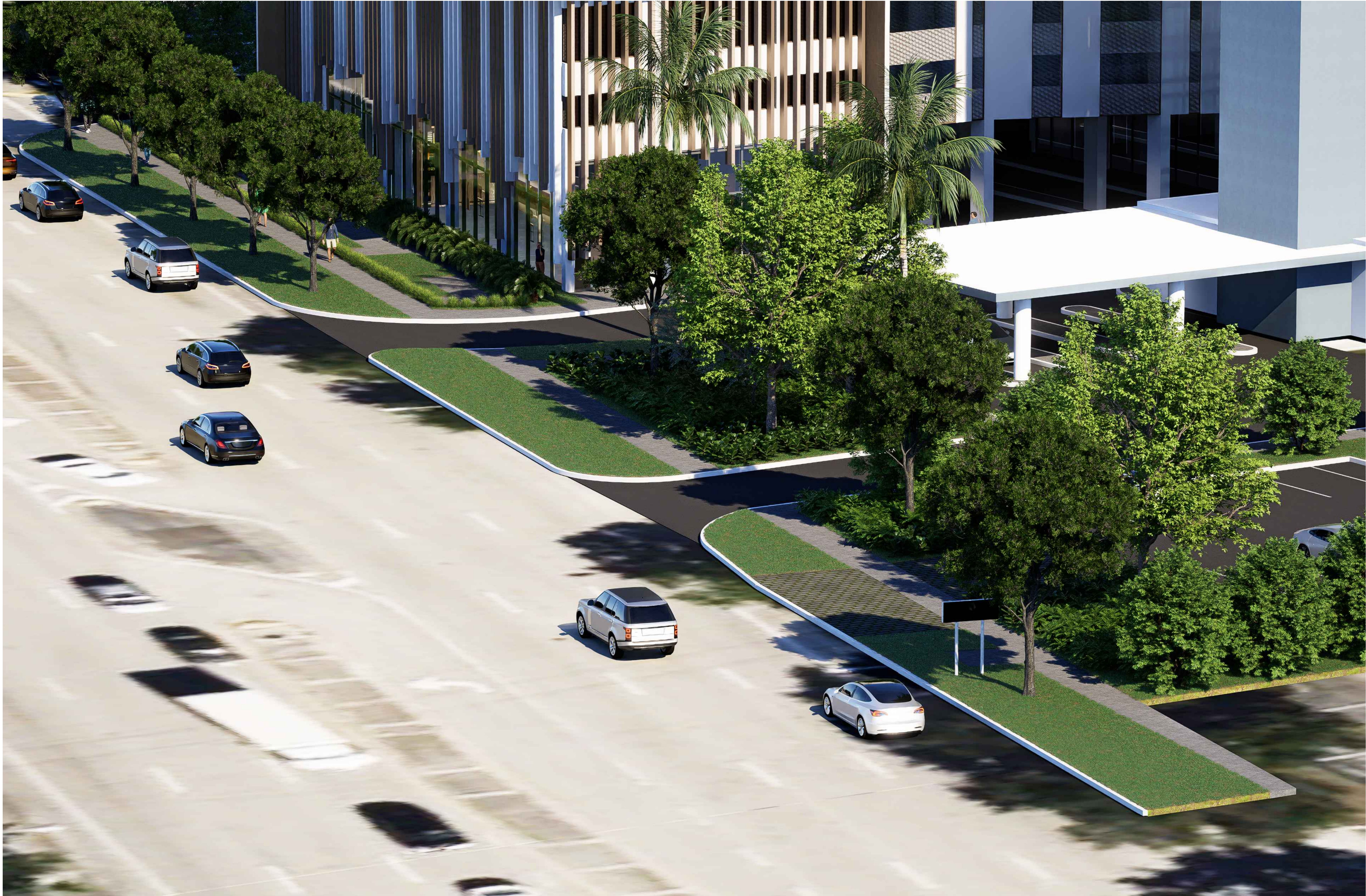
FIRE TRUCK ENTRANCE ON FEDERAL HIGHWAY